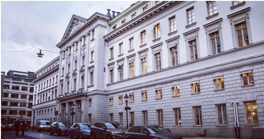
Venue: Westmanska Palatset, Holländargatan 17, Stockholm

What are the requirements in terms of novelty and inventive step that prevail in different jurisdictions, for a patent application filed later than an earlier application which has not yet been published? Are there special provisions concerning self-collision? How do these issues relate to grace period and prior user rights provisions? What are the views of governments, industry and patent attorneys in these issues that currently dominate the discussions on substantive patent law harmonisation?